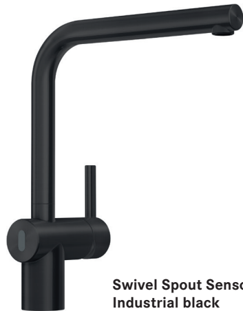
Swivel Spout Sensor Industrial black