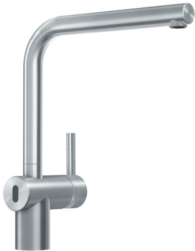
Swivel Spout Sensor Stainless steel

The Atlas Neo Sensor is based on the Franke's popular design classic, the Atlas Neo. Choose from swivel spout, pull-out nozzle or pull-out spray versions in Stainless Steel or Industrial Black finishes. Offering long-lasting value and a stylish yet ageless design that transcends trends and time, the Atlas Neo Sensor is the ideal touch-free tap for every home!