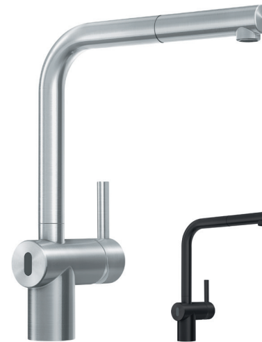
Pull-Out Nozzle Sensor

* originally supplied with the tap (rechargeable batteries not recommended)