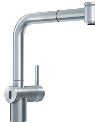
Pull-Out Spray Sensor